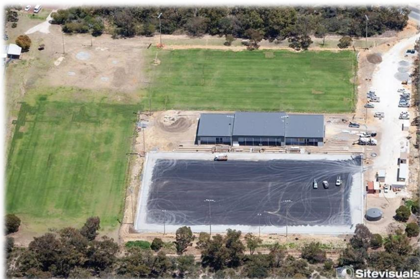
Aerial view of the Warwick Hockey Centre under construction in October 2016