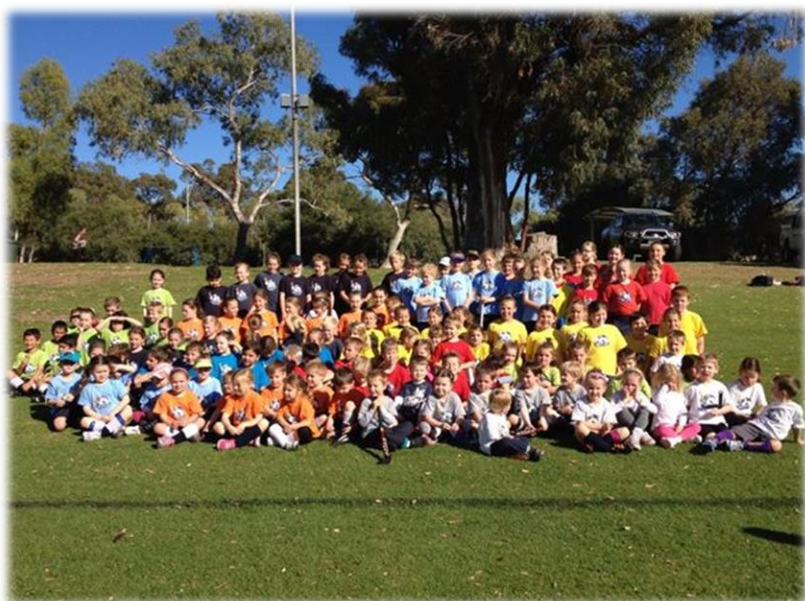
The future of the Club – our pre-primary junior program members

Sponsorship funds will be used to develop our juniors, train our coaches and volunteers, maintain our facilities and ensure the programs that we run to develop the sporting community are sustainable.